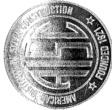
Charles J. Carter

Standard for Steel Building Structures Certified Bridge Fabrication - Advanced (Major) Standard for Bridge and Highway Metal Components Fracture Critical Endorsement Sophisticated Paint Endorsement - Enclosed